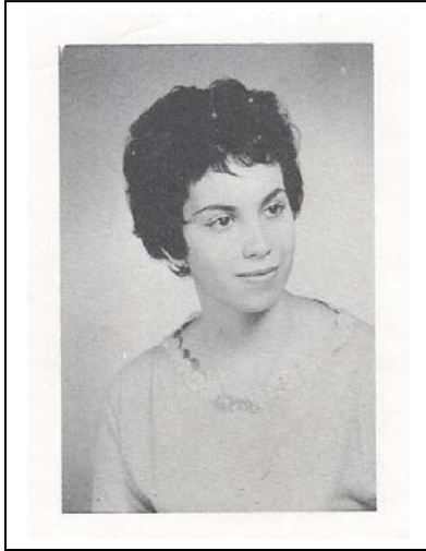
Secretary & Business