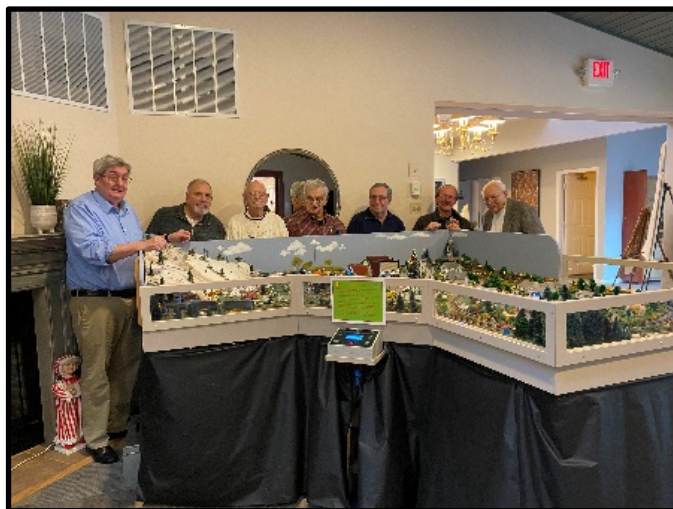
2021 Club Members

Everyone in the club thoroughly enjoys creating the miniature world for everyone to enjoy. We particularly enjoy watching the reaction as our neighbors and their guests look at the setup.