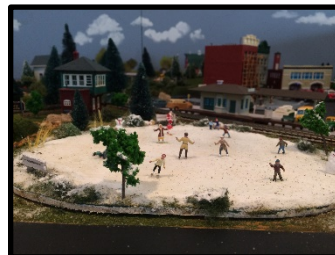
Ice skating pond