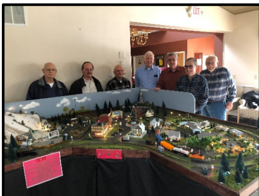
Christmas 2018 layout

After that season, we decided to add to the layout. The updated version added a 4 ft by 4 ft section to the original 4 ft by 8 ft table resulting in the current L shaped configuration. There were also many "behind the scenes" features added that improved the stability of the setup. The track layout was changed from the figure 8 to a dual loop of tracks to support the operation of two trains at the same time. Other additions included the expansion of the Foxwood Village diorama to include a scale model of the clubhouse, pool and bocce courts (developed by Frank Wildenauer). Frank also built the ski mountain.