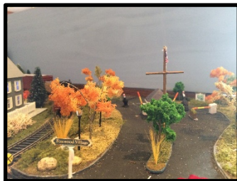
Foxwood Village Entrance

dioramas including the beach / marina scene and the ice skating pond, Brenda and Bob Merjave contributed the big duck that was built by their granddaughter, Hadley's wife, Inga, painted the backdrop, I created the Foxwood Village entrance diorama and everyone contributed to the layout of the town and to the scenic details of the entire display.