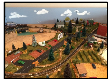
Beach / Marina, Big Duck, and vineyard

This display was moved up to the clubhouse during the 2017-2018 Christmas season. Everyone who viewed it was impressed with the quality of work and the detail.