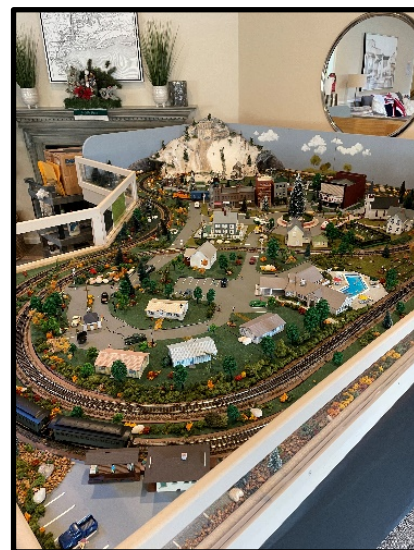
Christmas 2021 Layout

The primary modifications to the layout for the present (2021-2022) setup include a total redesign of the electrical system that controls the layout including the addition of an interactive control panel to allow people to activate several different scenes on the layout. Other significant additions included an operating carousel and the Suffolk Theater. The Grumman Park was also redesigned to better represent the actual park on route 25. Additional audio tracks were added that include music for the carousel and soundtracks for the theater.