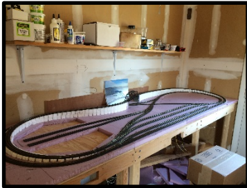
The beginnings of my garage layout

Fast forward to retirement. Once I finally retired in 2014 (about one year after moving into Foxwood Village) I had the time to once again pursue the hobby, but now it was no longer “playing” with “toy” trains but developing a realistic miniature world that included a railroad – model railroading.