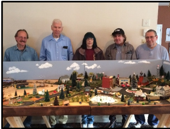
Our first large layout Christmas 2017

current layout comes from that haul thanks to Frank's generosity. Other residents in our community also donated model train material that they no longer needed. In addition, some of the club members had items to contribute. From this beginning we were able to start work on a larger Christmas display.