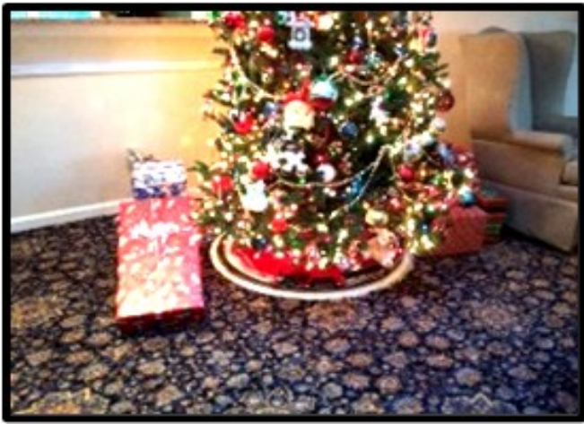
Figure 1. Our first display (2016)