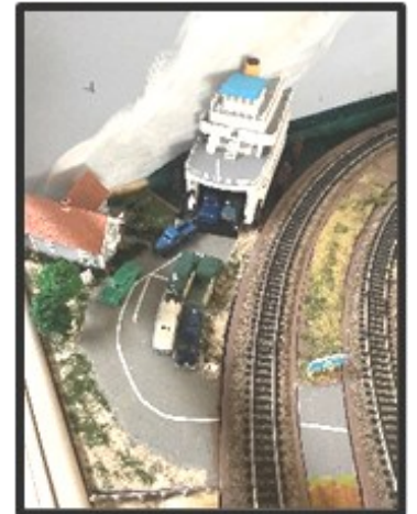
Figure 17. Orient Point Ferry (2022)