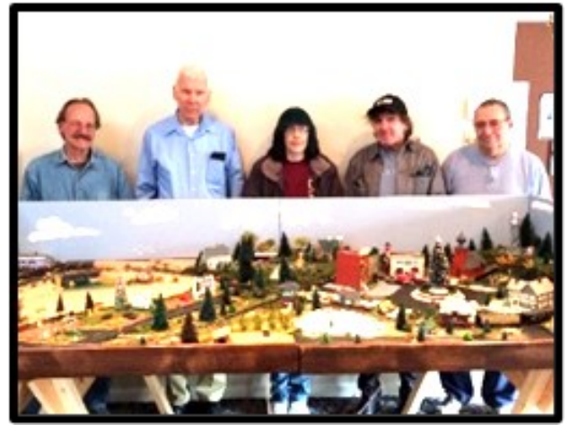
Figure 2. The 2017 display and some of the crew