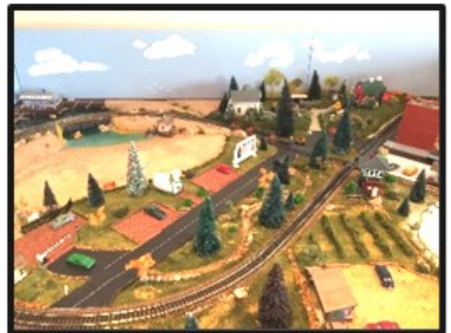
Figure 6. Beach, Farm, Big Duck, Vineyard (2017)