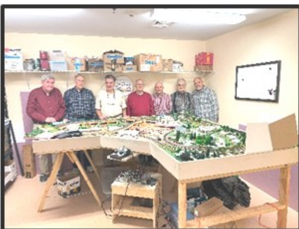
Figure 18. The 2023 layout (in process) and crew