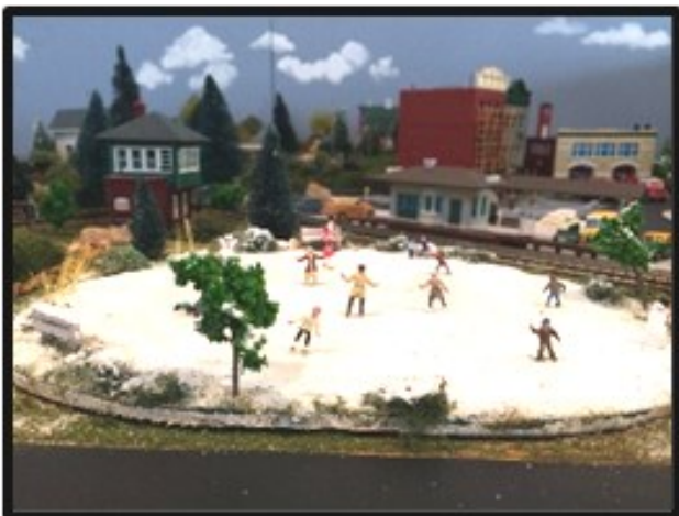
Figure 5. Ice Skating Pond (2017)