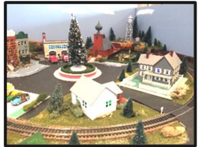
Figure 4. Riverhead Traffic Circle (2017)