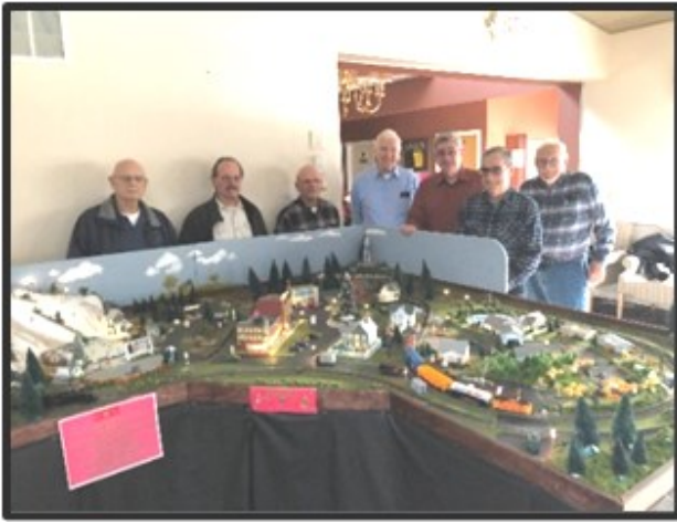
Figure 7. 2018 layout and crew