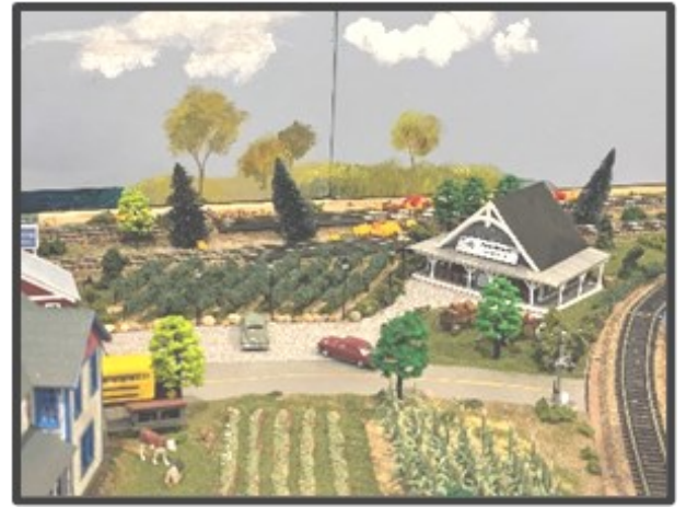
Figure 15. Vineyard (2022)