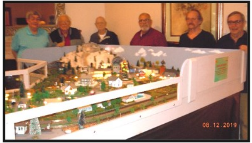
Figure 8. 2019 layout and crew