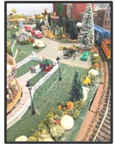
Figure 11. View of fun park (2021)