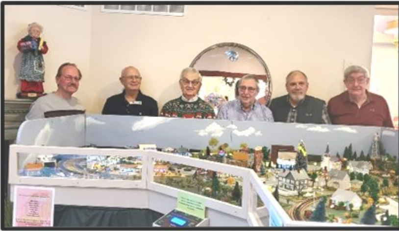
Figure 14. 2022 layout and crew