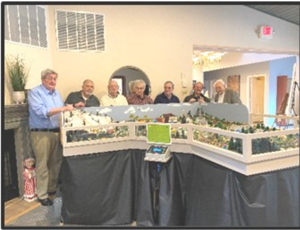
Figure 9. 2021 layout and crew