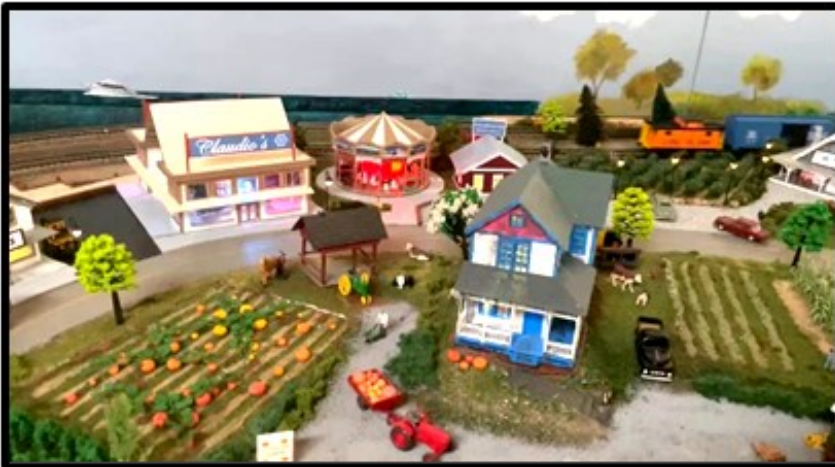
Figure 16. Claudio's, Carousel, Pumpkin Farm (2022)