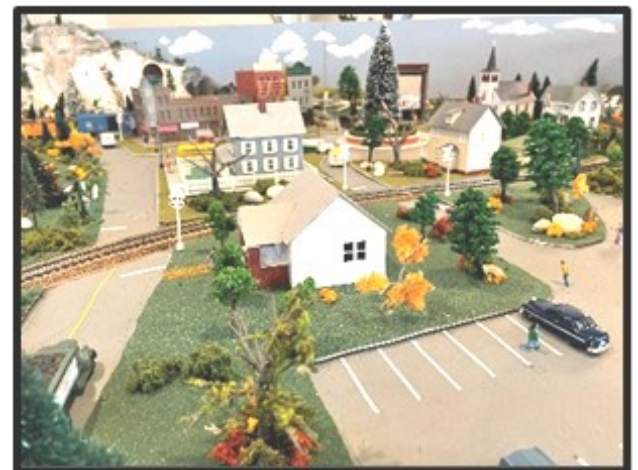
Figure 13. Overview of layout (2021)