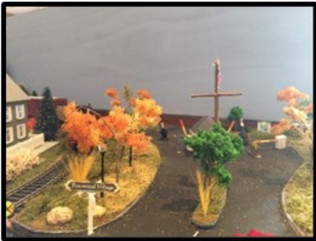
Figure 3. Foxwood Village Entry (2017)